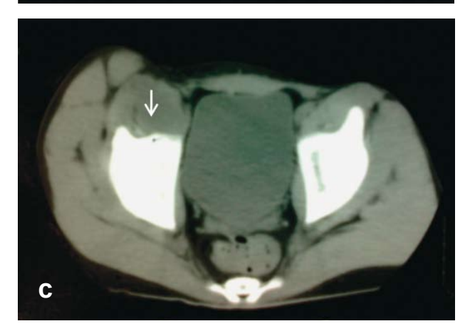
Figure 1. Computed tomography findings: